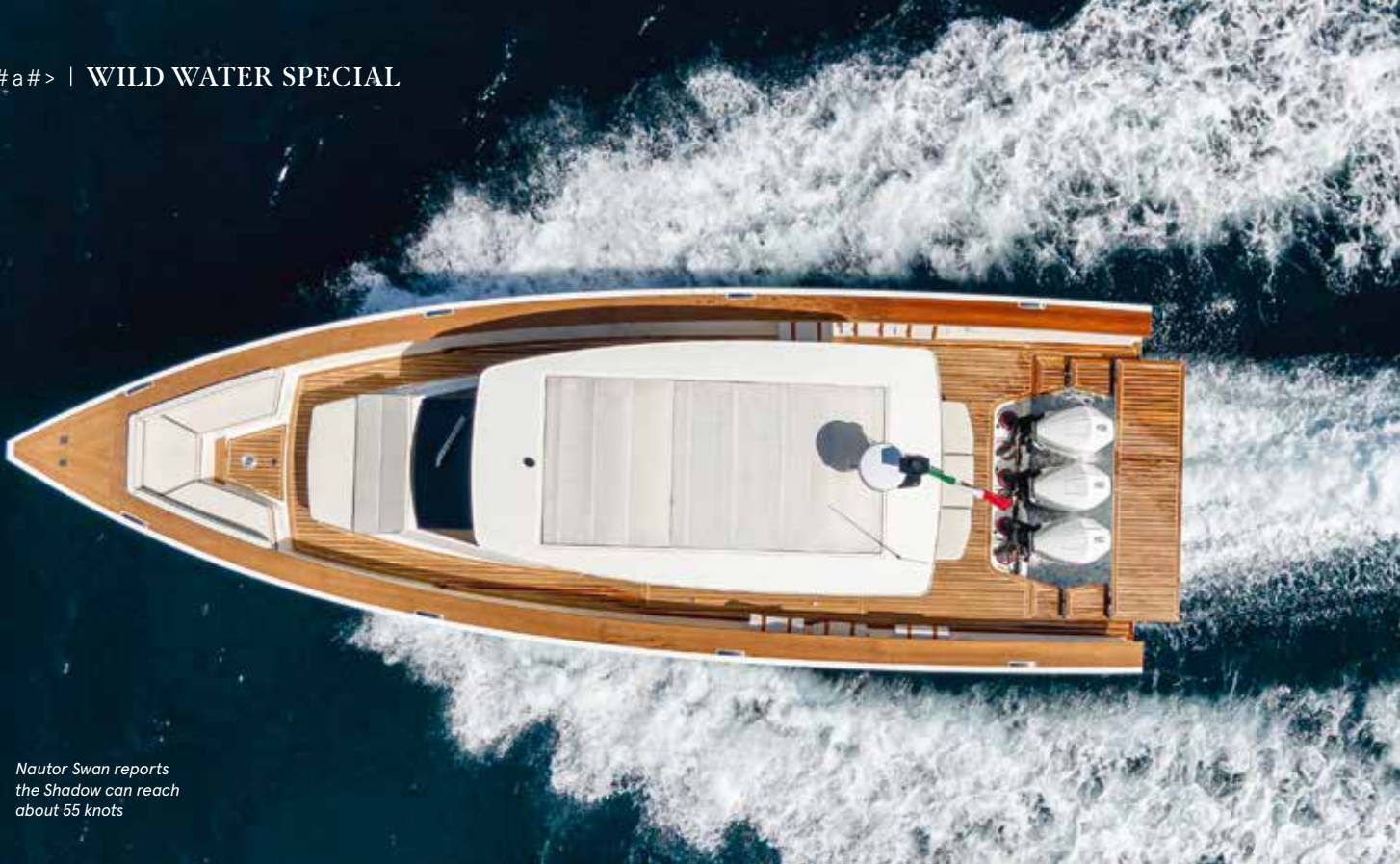
Nautor Swan reports the Shadow can reach about 55 knots