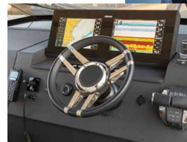
Clockwise from top left: minimalist lines and crisp interiors; the axed bow is part of the pared-back design; the untreated teak throughout is richly grained and expertly cut; the geometric console

classic sloop. When paired with an axe bow, the design practically screams out its Nordic descent. Despite being an Italian-run company, Nautor Swan builds in Jakobstad, Finland, though the motor yacht division is in Bergamo, Italy. The no-nonsense Finnish influence shapes this boat's identity. She feels like a pared-back sailing boat on board, with wide gunnels and an open transom.