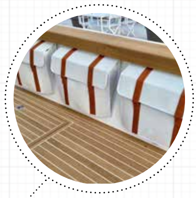
Satchels on the inside wall of the gunnels show the close attention to every detail