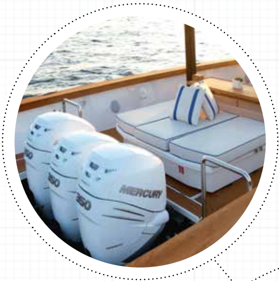
Triple 350hp Mercury outboards had the Shadow up to 40 knots in just 22 seconds with our writer at the wheel