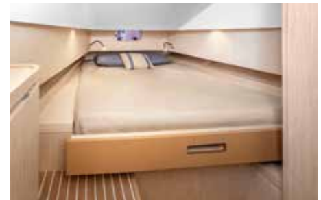
Above: the neutral palette speaks of the yacht's Nordic roots. Left: the three Mercury outboards. Below: visibility from the wheel is excellent

"There's lots of power, you feel the driving environment viscerally"